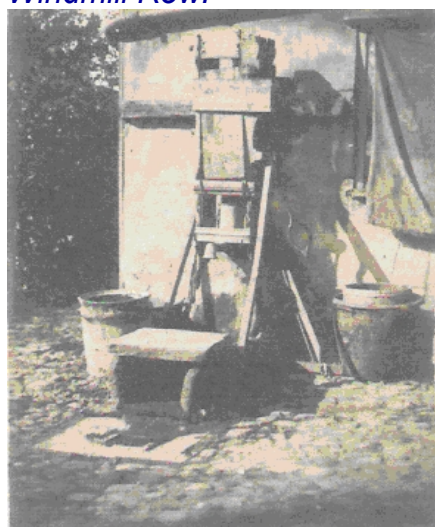
Post Office pump 1906

place the bread in the oven and remove the finished loaves. Along the centre and on both sides were hollow benches with removable tops. The lorries delivering flour from Bakers Mills at Cornard or Clovers at Sudbury parked beside the bake-house, then the bags were hauled up through a doorway into the upper storey and the flour let down into the benches as required. I cannot remember going into the top storey but I can remember watching George and grandfather kneading the dough in the evening and grandfather taking the loaves out of the oven. I can also remember seeing rows of shining hot cross buns. After the bread was baked the oven was still hot and for a few coppers people used to bring their dinners to be cooked. Some I can remember came from as far away as Windmill Row.