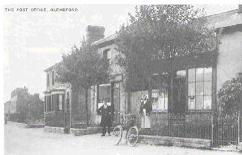
Glemsford Post Office in 1900

grandmother as she was 'fleet of hand'. The stamp in her hand moved like lightning from the ink pad to the envelope and then back again. The mail was then put in a bag which was tied up and the knot sealed with a metal seal to await collection.